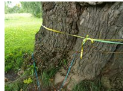
Ribbons with national ornaments ("prievītes") on the Kaive Oak