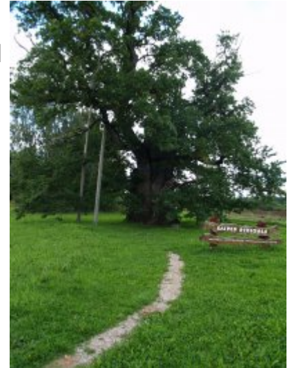
Kaive Oak.