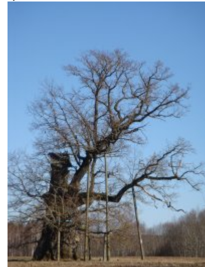
Kaive Oak, Spring 2015.