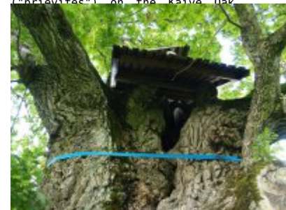
Rooflet and ribbons with national ornaments ("prievītes") on the Kaive Oak.