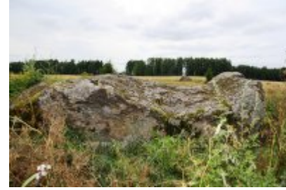
Andrecēni Devil Bed.

State archaeological heritage (State Inspection for Heritage Protection, No 2468). 4.3 m long, 3.1 m wide and 1.1 m high; dimensions of the pile: 5.00 m and 3.85 m, circumference of 12.1 m, volume of 6 m 3 . Shape of the stone - irregular, flattened loaf-like with an inward-bent top (a large trough-shaped hollow). The stone has not been moved. 42 m N from the Devil Bed Stone, in an open field there is another secular stone of local significance (3.5 x 3.2 x 1.8 m, volume of 8 m 3 ), the connection of which to the nearby Devil Bed is not known at the given moment. However, it is unlikely that the stone lying so close to the heritage Devil Bed Stone could have stayed without any attention in ancient times. (A. Grīnbergs, 2010)