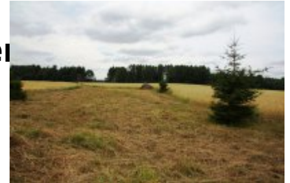
Andrecēni Devil's Bed.