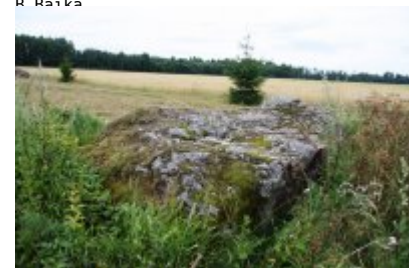
Andrecēni Devil's Bed.