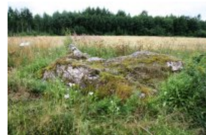
Andrecēni Devil's Bed.