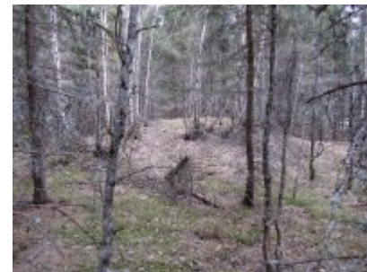
A mound at Runsta