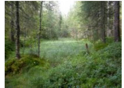
Hillstaröningen and surrounding landscape