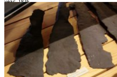
Iron currency bar from Hillstaröningen