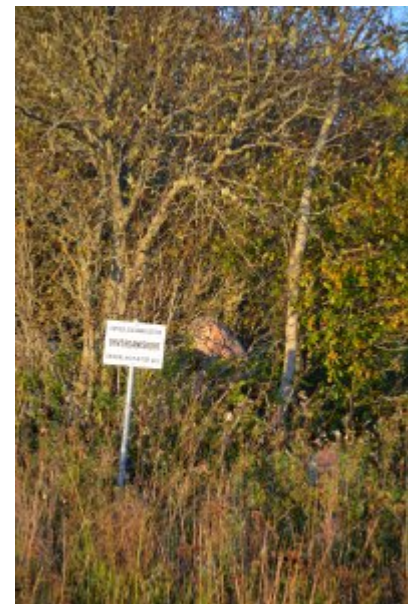
Mäla Hiimägi (Mäla Sacred Grove Hill).