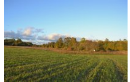
Mäla Hiimägi (Mäla Sacred Grove Hill).