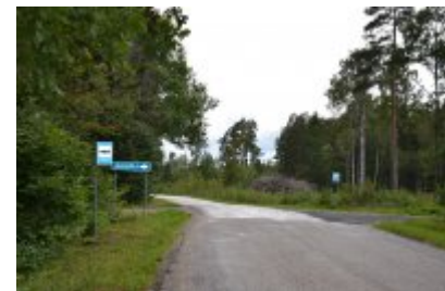
Järlepa risttee (Järlepa crossroad).