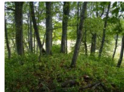
Ģērķi God's Hill.