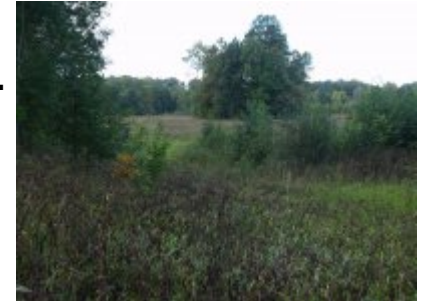
Ģērķi God's Hill.