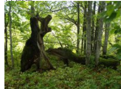
Oak on the Ģērķi God's Hill.